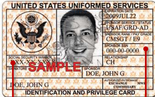
DD Form 1173